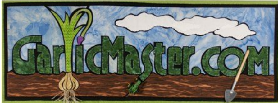
See how much fun you can have with fabric?

LOOK FUNNY, ACT FUNNY, & NOW SMELL FUNNY! EAT PAINT CREEK FARM GARLIC!